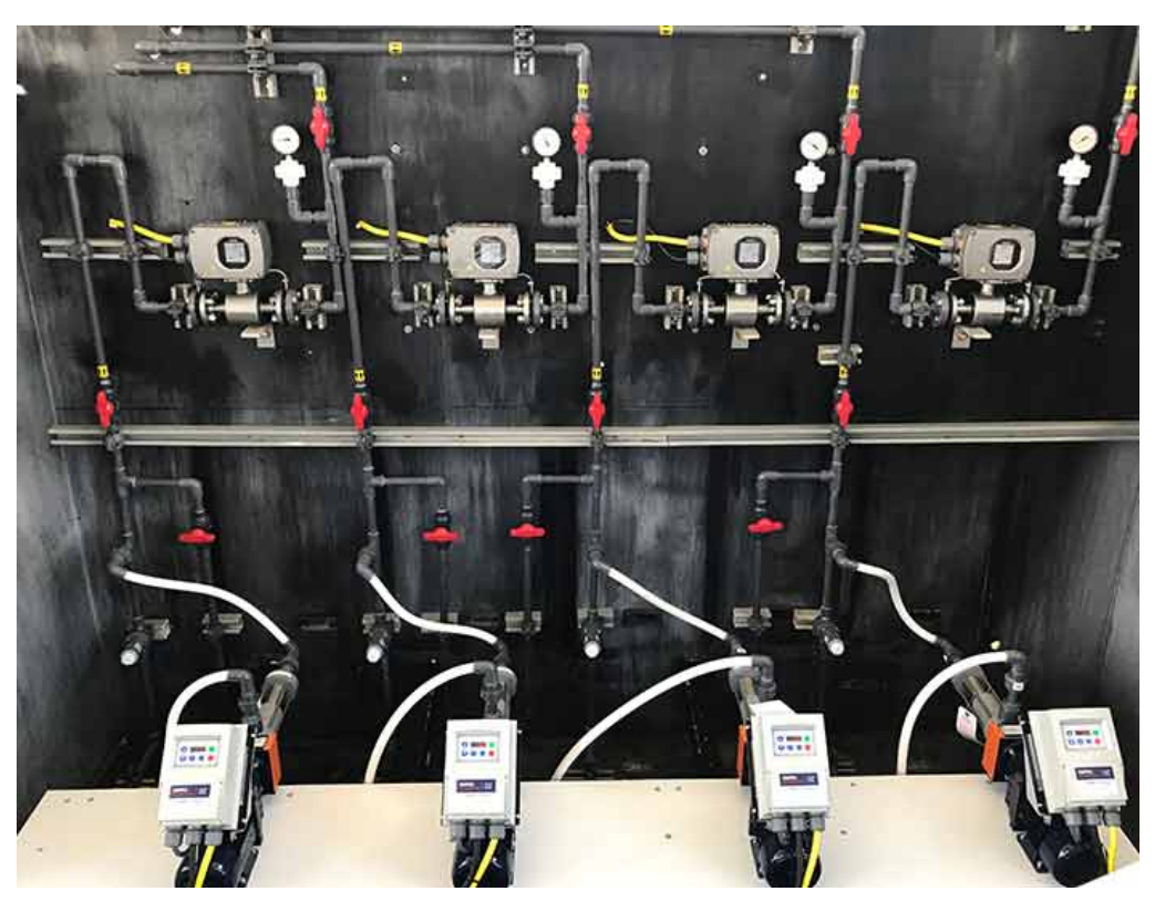
Image 1. The progressive cavity pumps used at SWRF require fewer parts, simplifying the system and lowering costs.

To reduce irrigation's impact on one of the city's main sources of drinking water—the mid-Hawthorn Aquifer—the city of Cape Coral has two wastewater facilities that reclaim and reuse treated wastewater for irrigation: Everest Water Reclamation Facility and Southwest Water Reclamation Facility (SWRF). The city also has more than 300 wastewater pump lift stations and numerous freshwater canal pump stations to supplement the irrigation system.