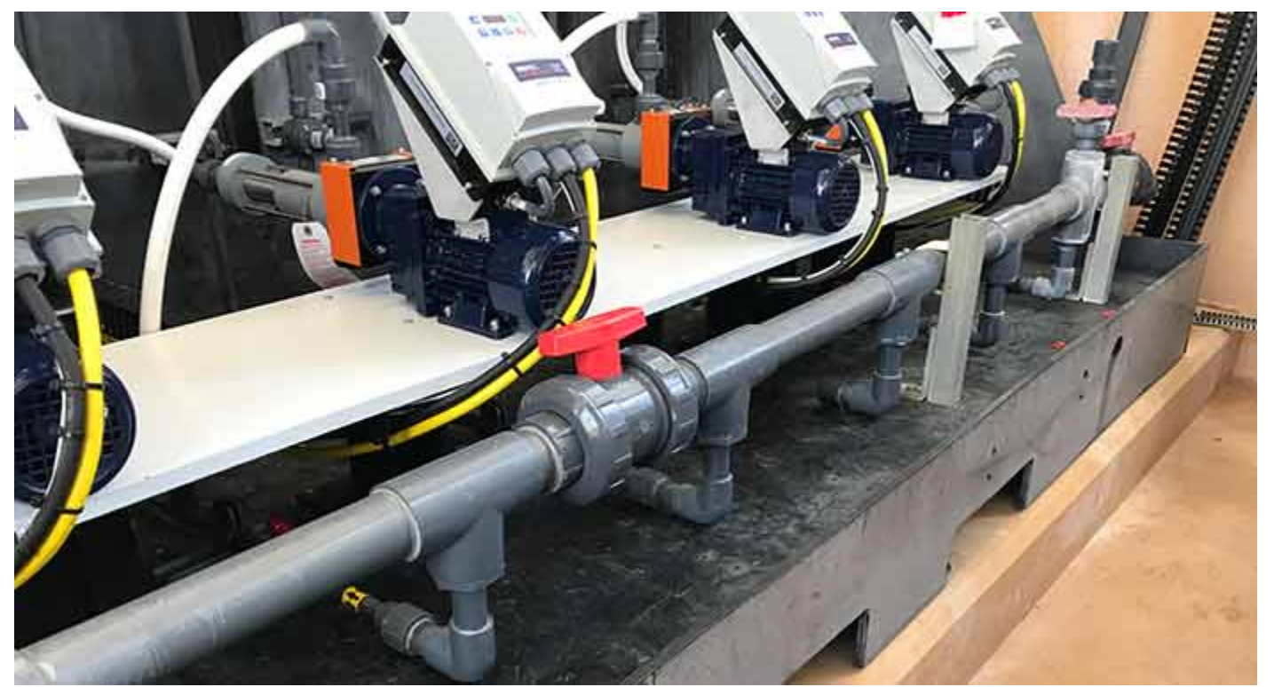
Image 3. This chemical metering system was built based on utilizing the best practices for sodium hypochlorite handling and distribution. Since installation at SWRF, the new PCPs have required zero maintenance.

SWRF installed its first PCP in early 2017 and has since installed three more, with two spares available as backup. They are fitted with flow meters and controlled by variable frequency drives (VFDs). Three of these pumps feed sodium hypochlorite to the clarifiers and are set to 6 gallons per hour (gph). The fourth is used at the backwash filters and is set to 10 gph.